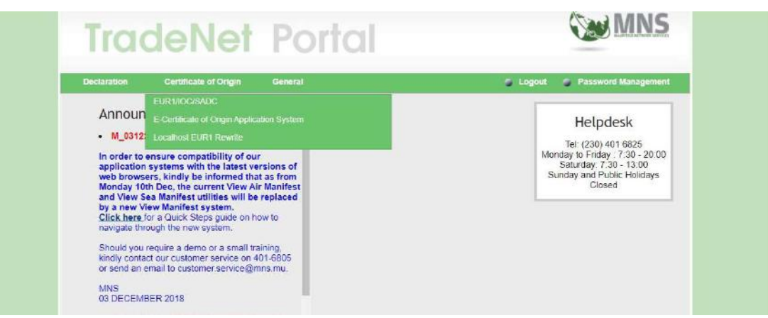
Figure 2: Selecting E-Certificate of Origin Application System

3. Go to Certificate of Origin and click on E-Certificate of Origin Application System from the drop-down menu as shown in Figure 2 below.