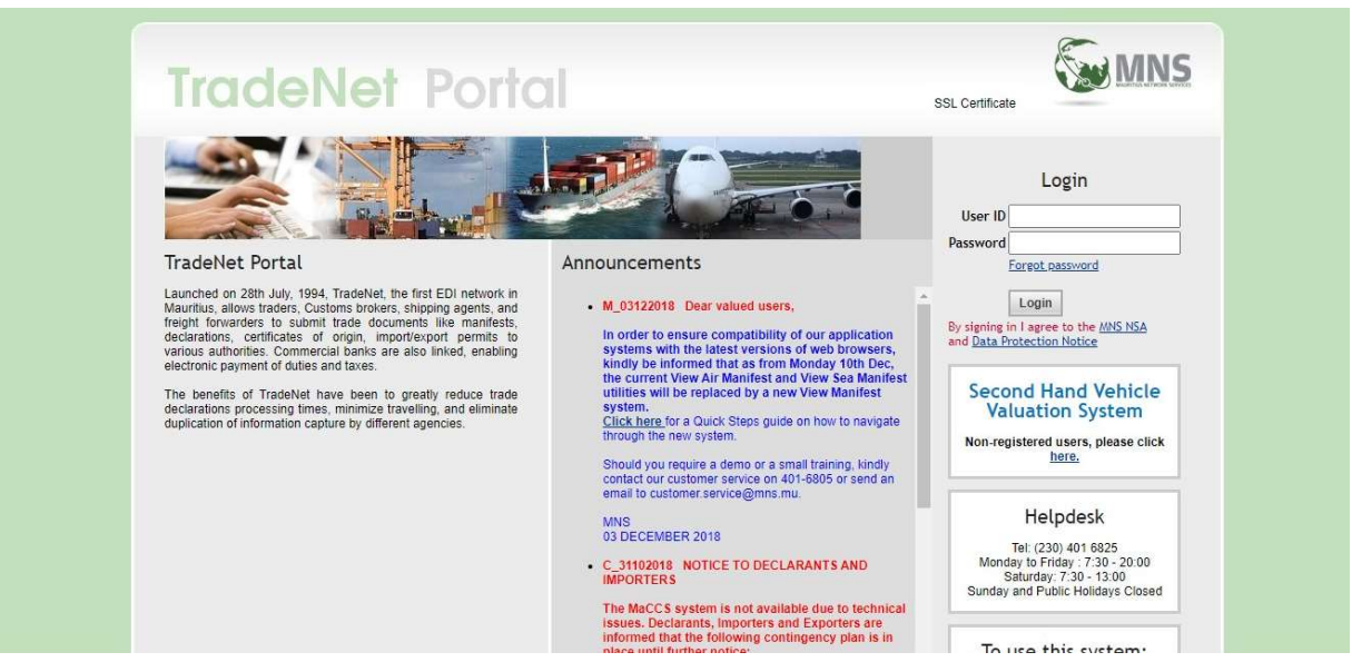
Figure 1: Log In Page

3. Go to Certificate of Origin and click on E-Certificate of Origin Application System from the drop-down menu as shown in Figure 2 below.